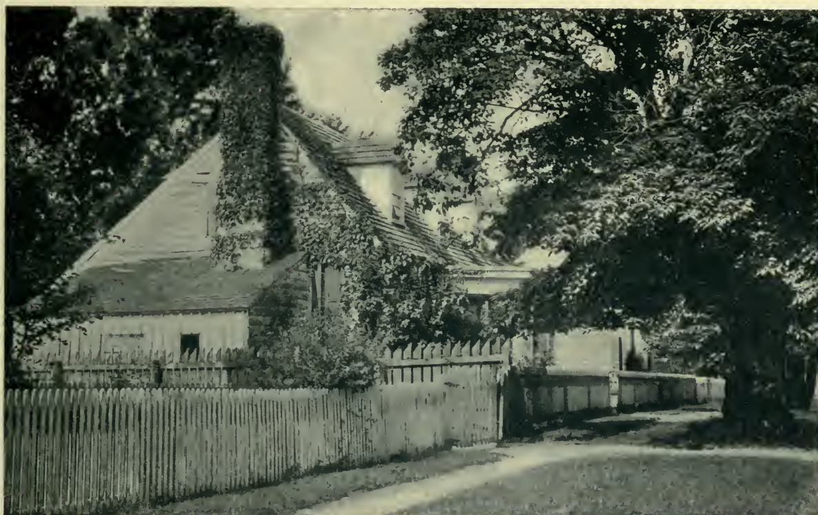
HOUSE ON DUKE OF GLOUCESTER STREET, WILLIAMSBURG, VIRGINIA

Williamsburg was founded in 1632. It was the center of Colonial growth in the South from 1698, when Governor Nicholson removed the seat of government from Jamestown to this place. The town contains many excellent examples of low, picturesque wooden houses built in the latter part of the seventeenth century